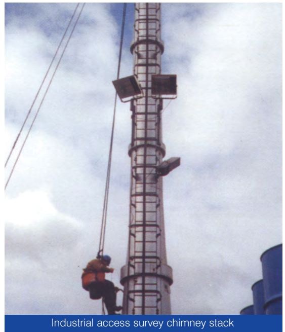
Industrial access survey chimney stack